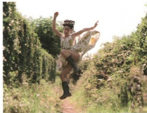
Co-commissioned by Arnolfini, Sheffield Theatres, Danceworks UK Ltd, Nuffield Theatre, Hall for Cornwall in association with Dance Agency Cornwall. Funded by the Arts Council of England, Sheffield City Arts and The Esmée Fairbairn Foundation.

Set in a white landscape, strewn with autumn leaves, this production is a rich and playful look at love, full of vitality, innocence and a healthy dose of cynicism. In contrast to the heartbreaking ferocity of last year's Drop Dead Gorgeous , Let the Mountains Lead You to Love releases six extraordinary performers from the restrictions of the city to a pastoral setting, to indulge in the confusions of sexuality, the puzzles of attraction and the joys of fake folk dancing. The company's striking physicality, dark humour and emotionally charged performance style ensure an evening of physical theatre at its raw and startling best. Funny, touching and achingly honest.