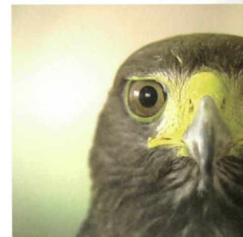
Dalziel + Scullion Raptor (courtesy the artists/Houldsworth, London)