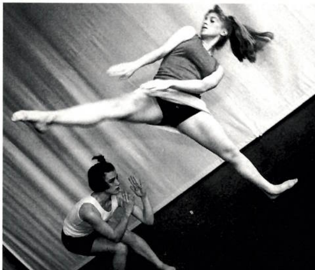
DanceXchange Ensemble